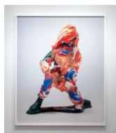
Richard Patterson Fair Park Pavillion Sculpture No. 3 , 2014 Framed archival C-type print 84h x 67.90w in 1 of 3 + 2AP