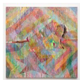
Steven Charles Let the Happiness In , 2021 acrylic on canvas 70h x 70w in