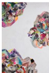
Josephine Durkin Flora 15 , 2018 Sewn digital prints on photo rag, Color-Aid paper, charcoal on paper, latex, spray paint, watercolor crayon, pastel and colored pencil 65.50h x 44w in