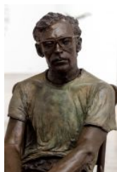
Harry Geffert Self Portrait , ca. 1995 cast bronze with patina 48h x 26w x 48d in