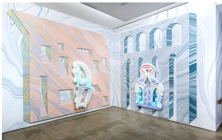
Windows and Walls , 2018, solo exhibition at Asya Geisberg Gallery, New York, NY