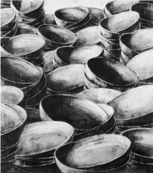
Paul Manes, Untitled , charcoal on archival paper, 58" x 53"