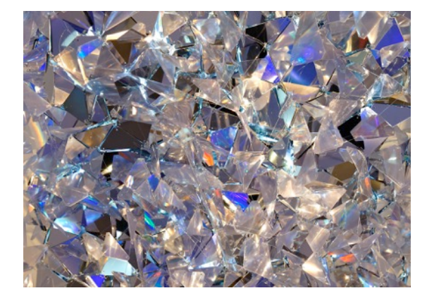
Untitled (detail), 2016 mirror styrene, LED, Plexiglas, power sources dimensions variable