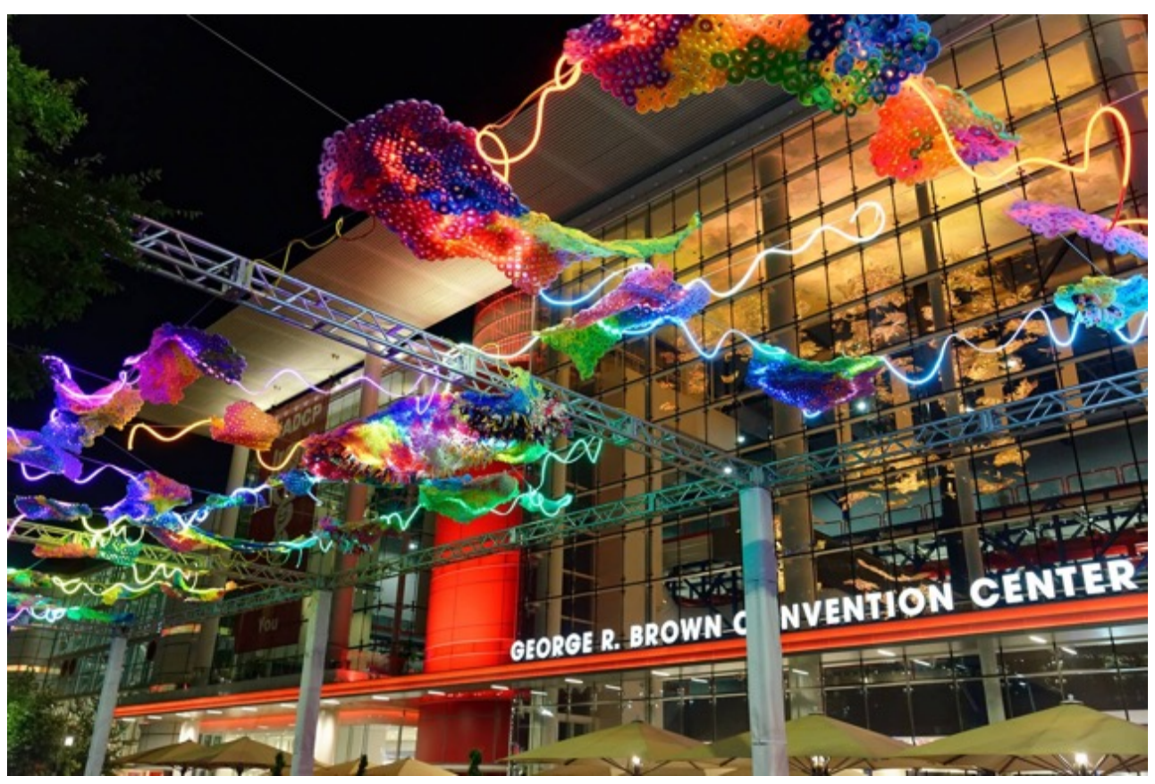
Green Chromatic Fields

Andea recognises that every major <u>art installation</u> consists of two main operations: one is the logistics and the other one is the creative part. If the former occupies her chiefly, then during the latter process, "When I assemble on the site all the structural units (mostly all finished before in my studio), I prefer to work alone and find my zen and ignore distractions in a <u>public space</u>. It is a balance hard to find when the most inner creative force meets the outside world. The installation as an art form needs to be created in the actual space of the <u>exhibition</u>."