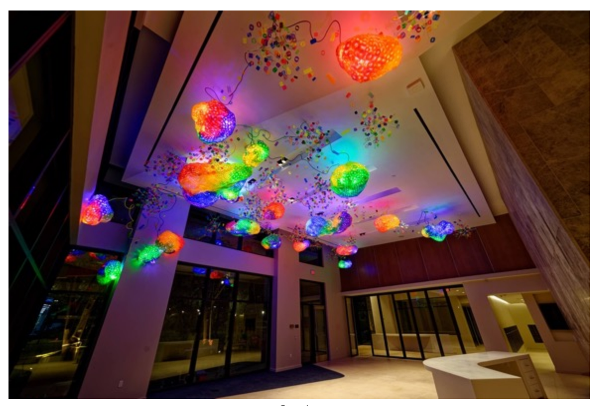
Caydon