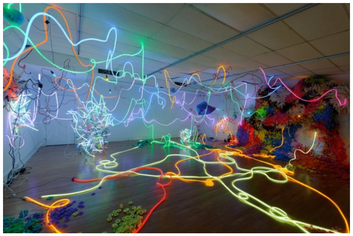
Primordial Garden

Joseph Kosuth, Jason Rhoades, just to name few, I was thrilled to exhibit next to their works in the same museum. Being able to exhibit among these famous artists gives me a platform to speak about the future of the light movement. I was ready to present the formal and conceptual parts of my work with an exhibition encompassing the latest technologies in the light and computer industries with the undertone of the overwhelming consumerism and digital aspect of this century and sublimities of climate change."