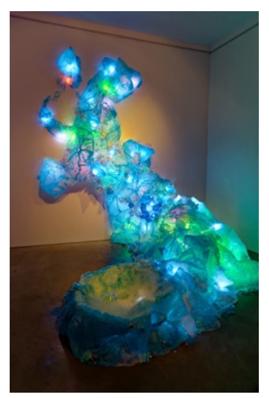
Passage through the frozen dusk

The glaring shift in the environment, causing an unhealthy balance, still remains outside the clear sight of the vision for many. Illuminating upon these changes are the kinetic light sculptures by the <u>Texas</u>-based <u>new media artist</u>, Adela Andea. The industrial electronic components such as light and plastic, designed in incongruent structures, offer organic shape to the installations. At the core of her artistic ideas lies the social responsibility for research that can ensure technological progress and ecological balance. Inspired by "nature, natural versus artificial concepts; environmental issues and technological advances", the artist aspires to blend aesthetically the romantic notion of nature with the manmade aesthetic.