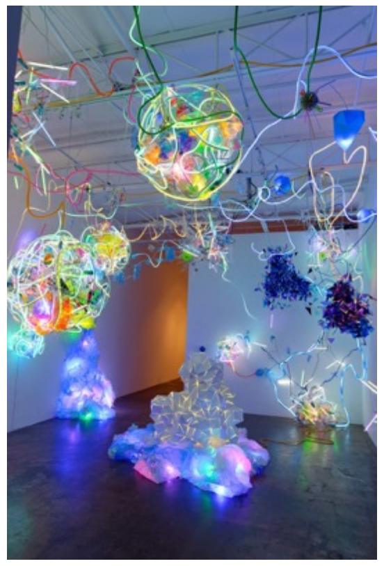
The Northern Lights

In an interview with STIR, <u>Romania</u>-born Andea shares, "My passion is to create large-scale <u>sculptures</u> and environment-installations that engulf the viewers and captivate through overstimulation by light. By stepping in and walking through the <u>installation</u> the audience becomes temporarily part of the artwork as they experience the artwork from inside and outside at the same time, thus challenging the notion of a fixed point of view. Environments according to Allen Kaprow are an extension of painting when referring to the issue of space."