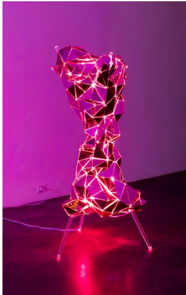
Poudretteite, 2016, Plexiglas, LED 60 x 32 x 32