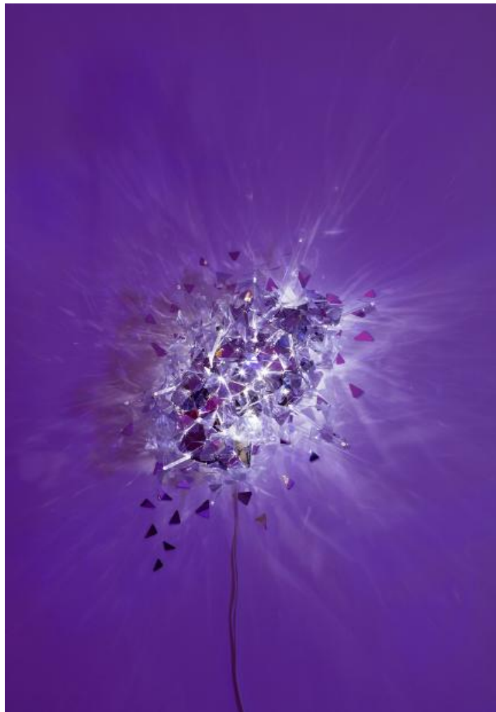
Surface Fusion, 2016, styrene, LED, Plexiglas 30 x 24 x 16. Installed: 40 x 28 x 16

Though that might not be the case for her piece titled Poudretteite. The title of the sculpture is named after an extremely rare, pink material. Of course, the piece is pink and though abstract, still seems to reference a body or dress. I see a clearer picture that Andea is using this sense of opulence as something to tap into and explore. It feels positive and playful. I just can't decide if she is also pushing the boundaries between fine and decorative art or blazing a trail for abstract art. Either way, she has made me think about her show for weeks.