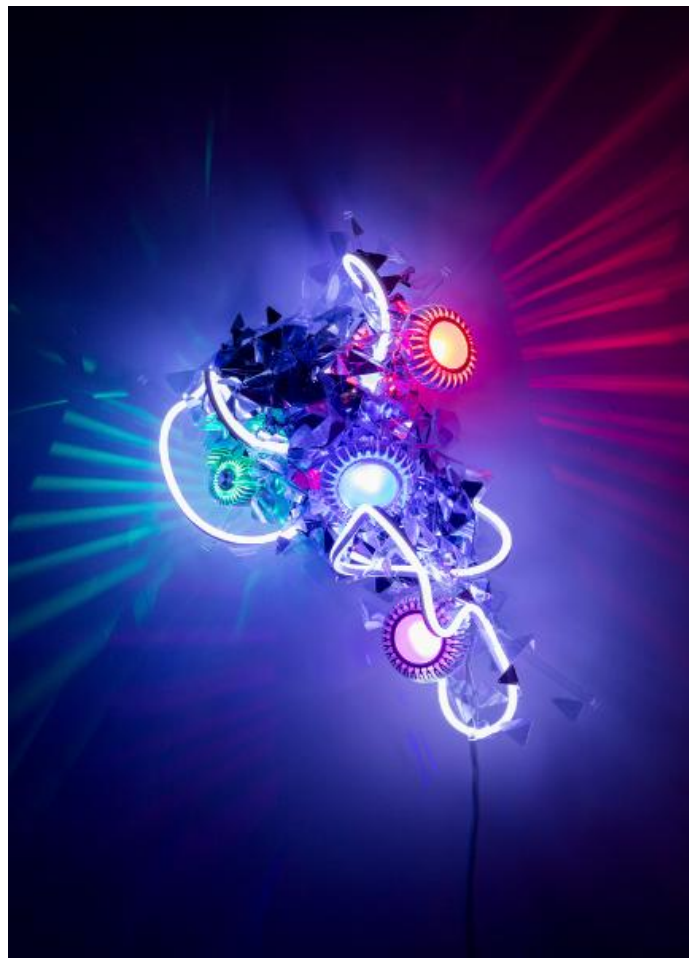
Jessant-de-lys, 2016, styrene, LED, Plexiglas 36 x 32 x 16