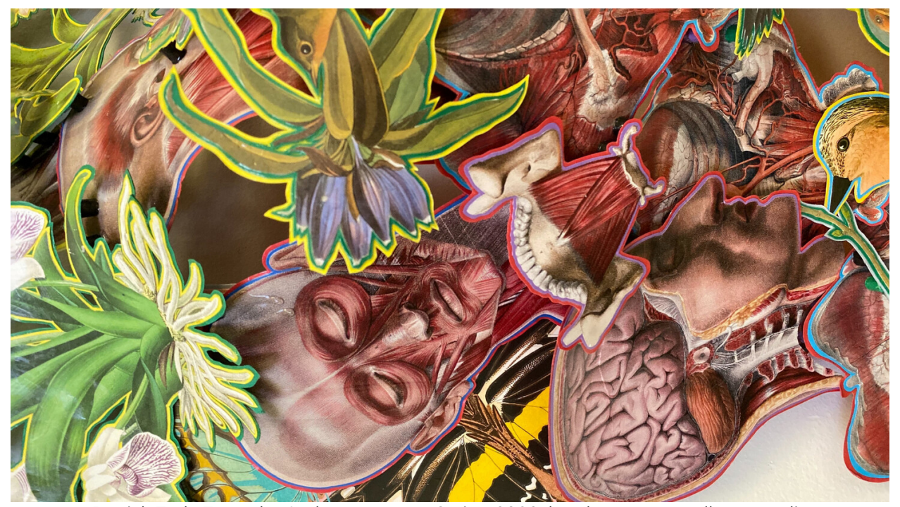
Patrick Turk, From the Anthropocosmos Series, 2020, hand-cut paper collage, acrylic

20 Jun – 15 Aug 2020 at the Cris Worley Fine Arts in Dallas, United States 4 JUNE 2020