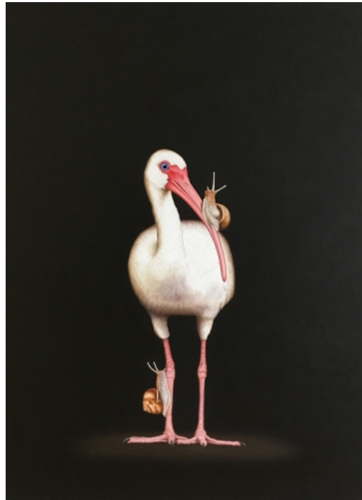
"Ibis/Snail" (from the Truce series) oil on canvas, 16" x 20"

For the past twenty-two years my goal has been to give a voice to animals.