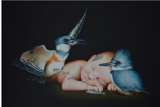
"Nurture" (from the Empathy series) oil on canvas, 24" x 20"

I am hoping that the depiction of children in my work will encourage my viewers to take a stronger stance on climate change.