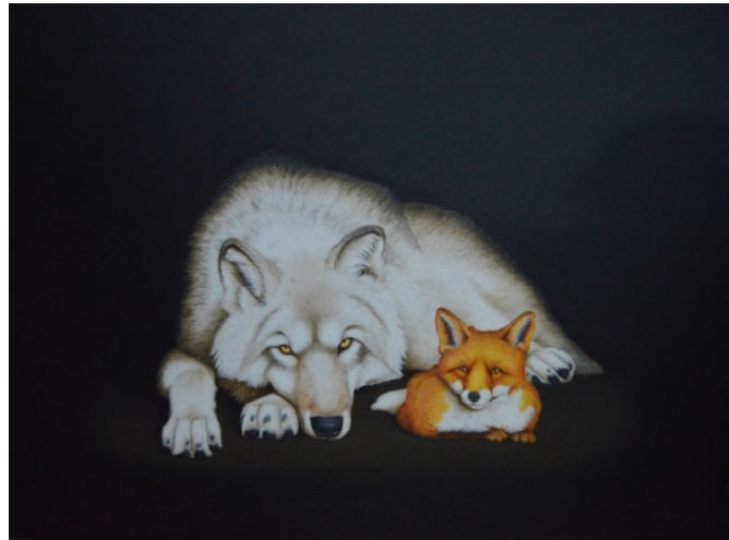
"Wolf/Fox" (from the Truce series) oil on canvas, 66" x 48"

To further illustrate this point, I sometimes use the juxtaposition of non-compatible animals in a painting as a way to convey the hope of peace, understanding and compromise between people of different backgrounds.