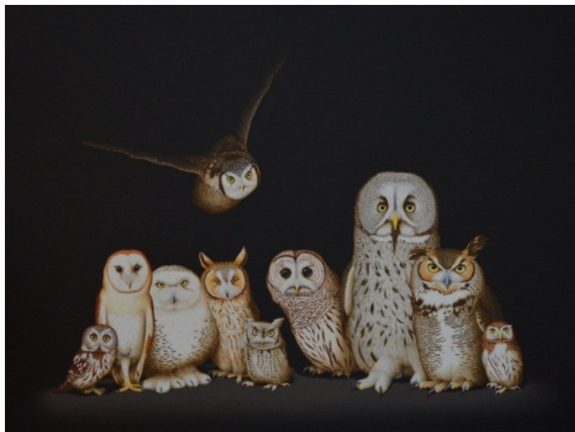
"Parliament" (from the Diversity series) oil on canvas, 48" x 36"