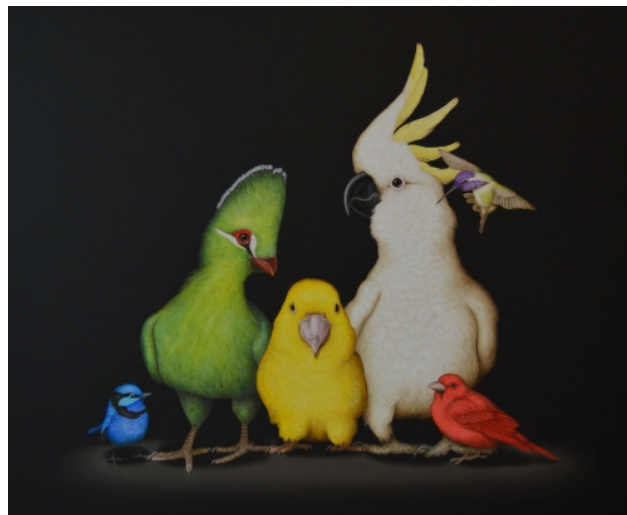
"Diversity" (from the Eyecandy series) oil on canvas, 24" x 20"

I paint in oil on canvas and all my subjects are painted life size. My work is extremely detailed—I use the smallest sized brush. I feel it is important for the viewer to be able to come very close to the painting and appreciate the fine detailed work.