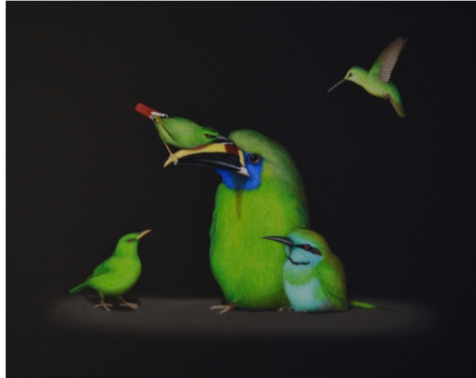
"Green Medley" (from the Eyecandy series) oil on canvas, 20" x 16"

I use my signature dark background to show off their beauty; these dark backgrounds force me to be as honest and truthful as possible with my subject matter and its execution.