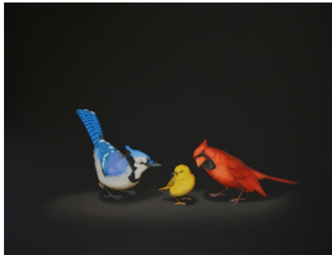
"Blue, Yellow & Red" (from the Diversity series) oil on canvas, 20" x 16"

For the past twenty-two years my goal has been to give a voice to animals.