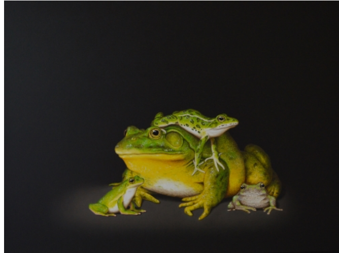
"Little Chorus" (from the Diversity series) oil on canvas, 26" x 12"

biodiversity in the wild to convey messages about bigotry, racism and homophobia.