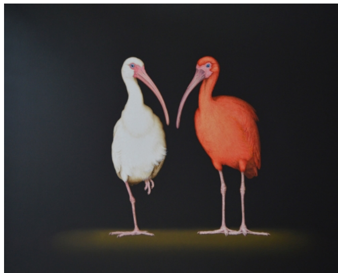
"White Ibis/Scarlet Ibis" (from the Truce series) oil on canvas, 24" x 20"

To further illustrate this point, I sometimes use the juxtaposition of non-compatible animals in a painting as a way to convey the hope of peace, understanding and compromise between people of different backgrounds.