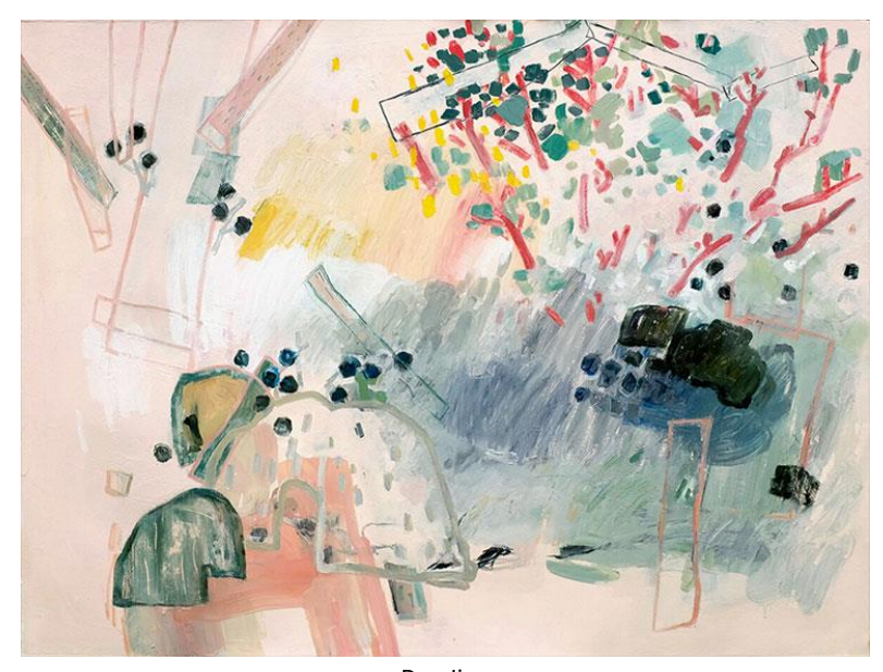
Dan Jian Untitled 2020 Oil on paper 30 x 40 inches