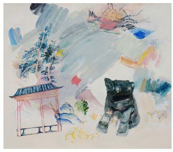
Dan Jian A Mountain Is Not a Mountain 2020 Oil on paper 24 x 27 inches