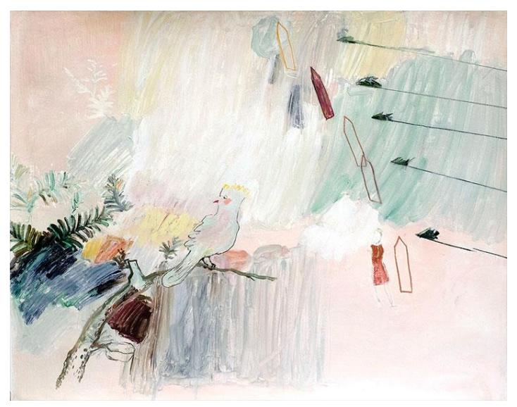
Dan Jian Untitled 2020 Oil on Paper 23 x 27 inches