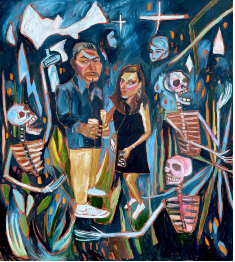
Cruz Ortiz, "La Lori y el Tonka in the Cumbia de los Muertos Super Mix," oil and wax on canvas, 72 x 84 inches.

featured thousands of artists from around the world, including many from Texas, and is widely recognized as one of the best showcasing avian art. More than 500 artists submitted works for the 2022 show, with 118 selected for inclusion, 60 of which are making the trip to RCA as part of the traveling exhibition."