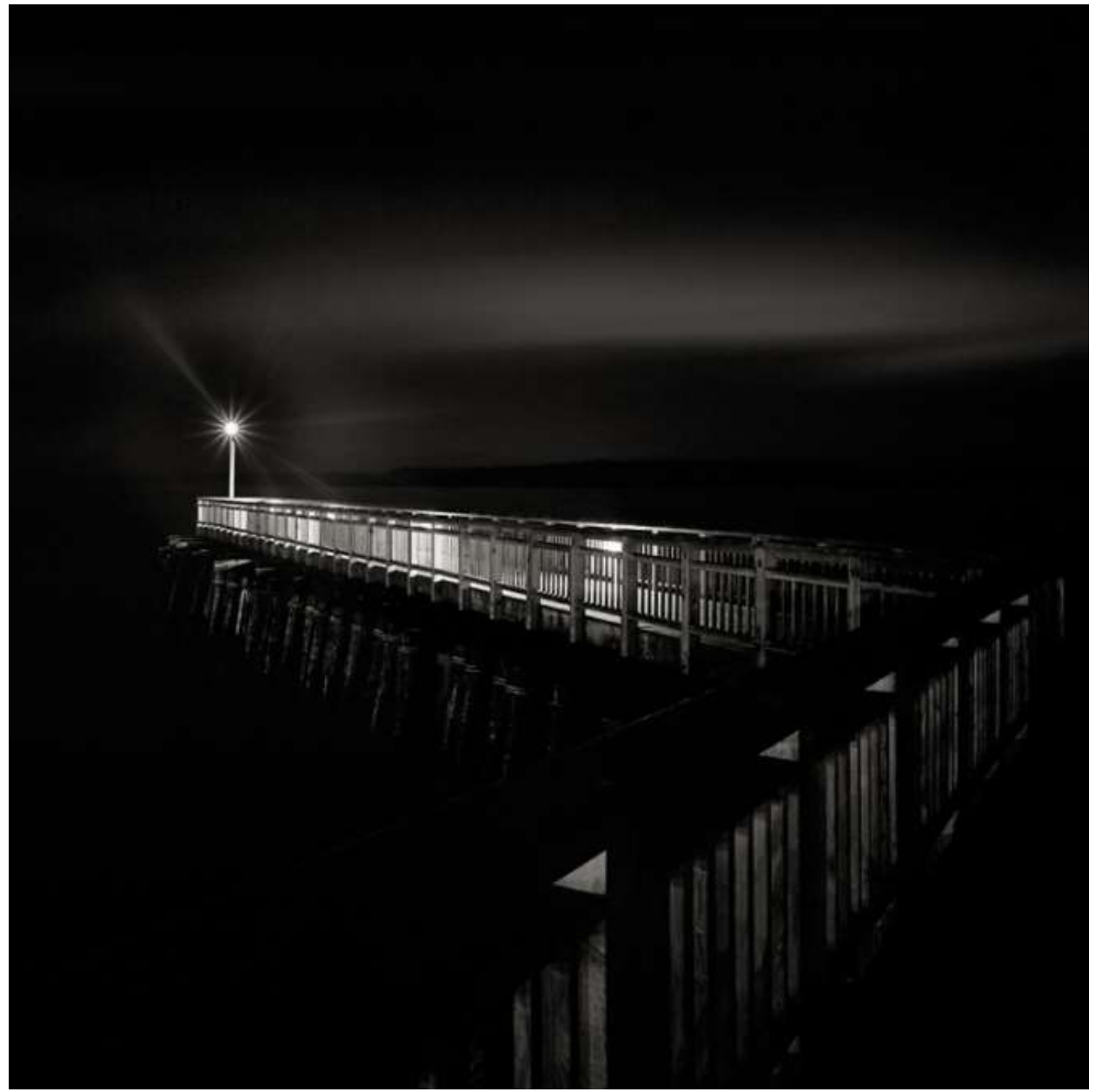
Nightwatch, Port Townsend, Washington 2002