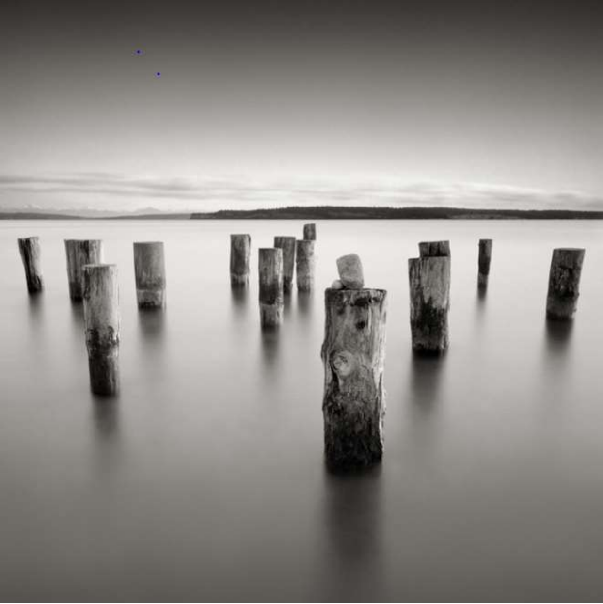
Balanced Stones, Port Townsend, Washington 2002