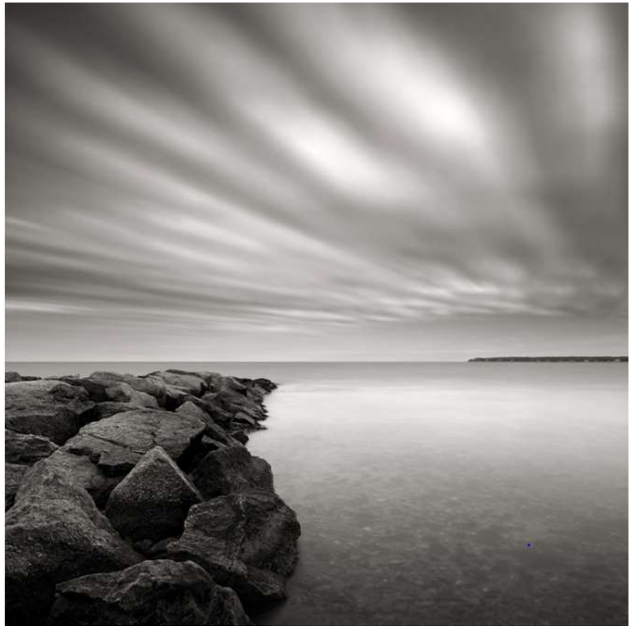
East Meets West, Vineyard Haven, Massachusetts 2009

#8 Could you please tell us something about your technique and creating process? (post-processing, equipment (digital/traditional), printing, favourite paper, etc...)