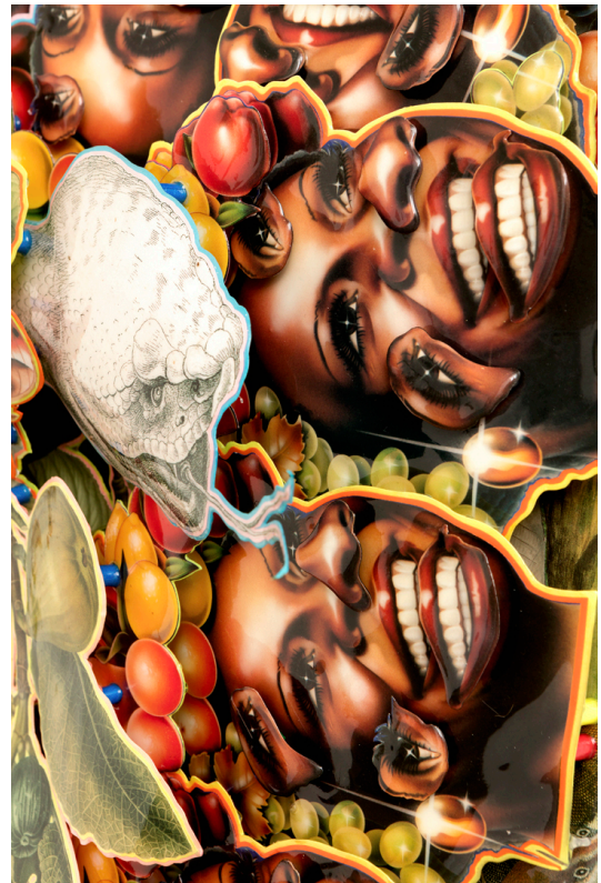
Patrick Turk, Beguiled (detail), 2016

Turk: Early on working with collage, I had this idea of keeping things as simple as possible. The thought was to explore collage techniques more than collage materials and always trying to keep the material side of things very pure and uncomplicated but doing complicated things with them. The physical materials remain largely the same, it's basically just books, paper, and glue. I also think the visual language of materials I use is still very similar to what I have been using for the last twenty years. I'm always looking for all types of illustration; be it medical, scientific, religious, advertising, botanical, instructional, etc. What has changed over time are the techniques I use to re-structure and manipulate these materials. For example, I find it more and more rare to be making 2-D collage these days, instead focusing nearly all my attention on 3-D collage. To do this requires completely different processes which I develop as I go along.