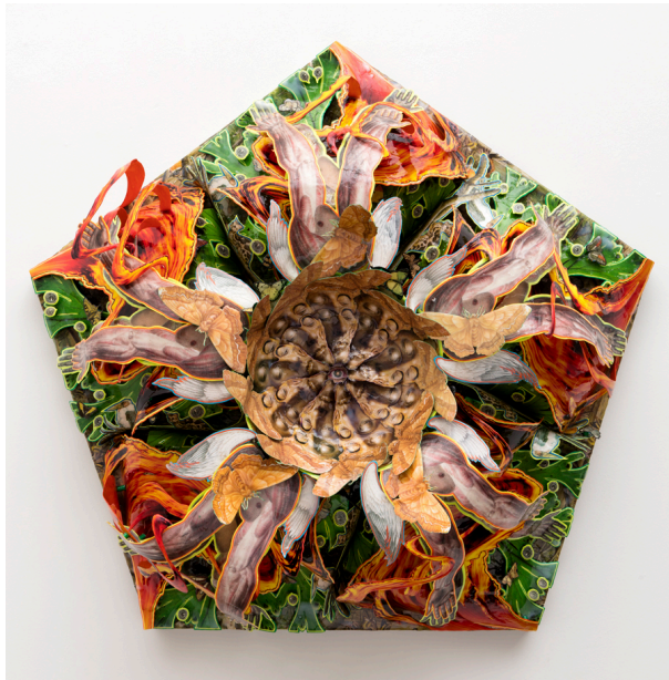
Patrick Turk, The Sentinel , 2016, hand-cut paper and mixed media on panel, 35 x 30 x 13 inches

Patrick Turk: I think so. I mean, I wasn't a hardcore sci-fi/fantasy kid but I think I always liked and related to it at some level. I got more into it as a teenager but I still think I like the idea of science fiction more than I like a lot of actual science fiction.