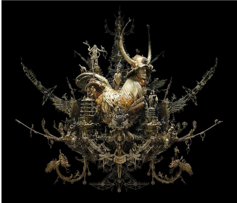
Kris Kuksi, Imperial Fowl , 2013. Mixed media assemblage (plastic, resin, wood, metal, enamel, acrylic), 33 x 31 x 9 inches.

difference. But, in the end, it's the open-minded collectors that make the Dallas Art Fair one like no other.