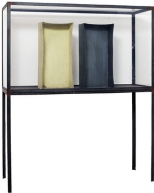
Joseph Beuys, Mit Schwefel überzogene Zinkkiste (Tamponierte Ecke), 1970. Zinc coated with sulfur, zinc with gauze, steel and glass vitrine, 67 x 55 x 19.75 inches. Edition of 200.