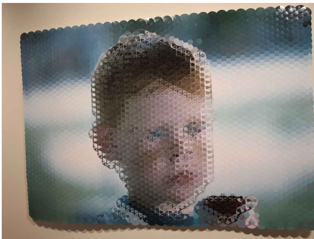
"Self Portrait" is a 2011 work by Rusty Scruby, an archival photographic reconstruction.

The piece will be traveling to an exhibit in Chicago after the Abilene show.