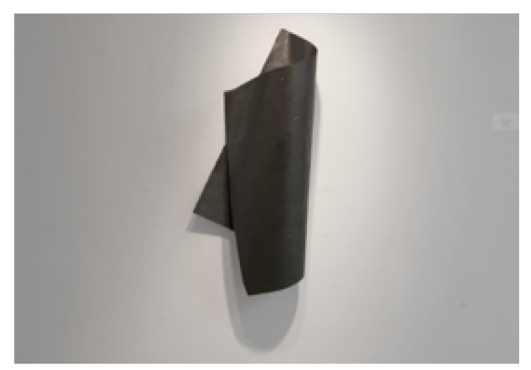
Harding, Folded Wall

After running other variations in the presentation and surface warp as he stared, Tim settled for one nail, low on the wall and bent in the left side, then gently rolled the bottom edge, as you see below. Now it's such a simple thing, superb in execution and placement, that it has taken over that wall, showing two vary different paper art forms at Timothy Harding's command. Our apprehensions were quieted, and we were startled at the sudden transformation.