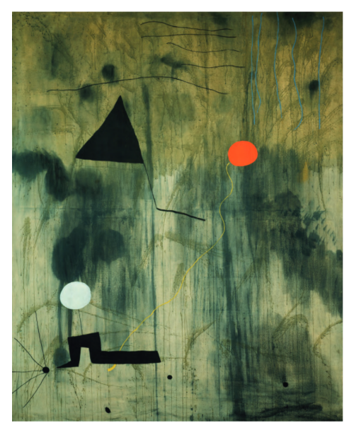
Joan Miró, The Birth of the World , 1925 Oil on canvas 250.8 x 200 cm The Museum of Modern Art, New York

The context of this renunciation of painting was the triumph of the 1917 Bolshevik Revolution in Russia, which called for new art forms dedicated to the Socialist ideal of proletarian usefulness and rejected painting as a bourgeois luxury. The death of painting—or at least of non-illustrational painting—is consistently born of a need to crush all forms of dissent from the