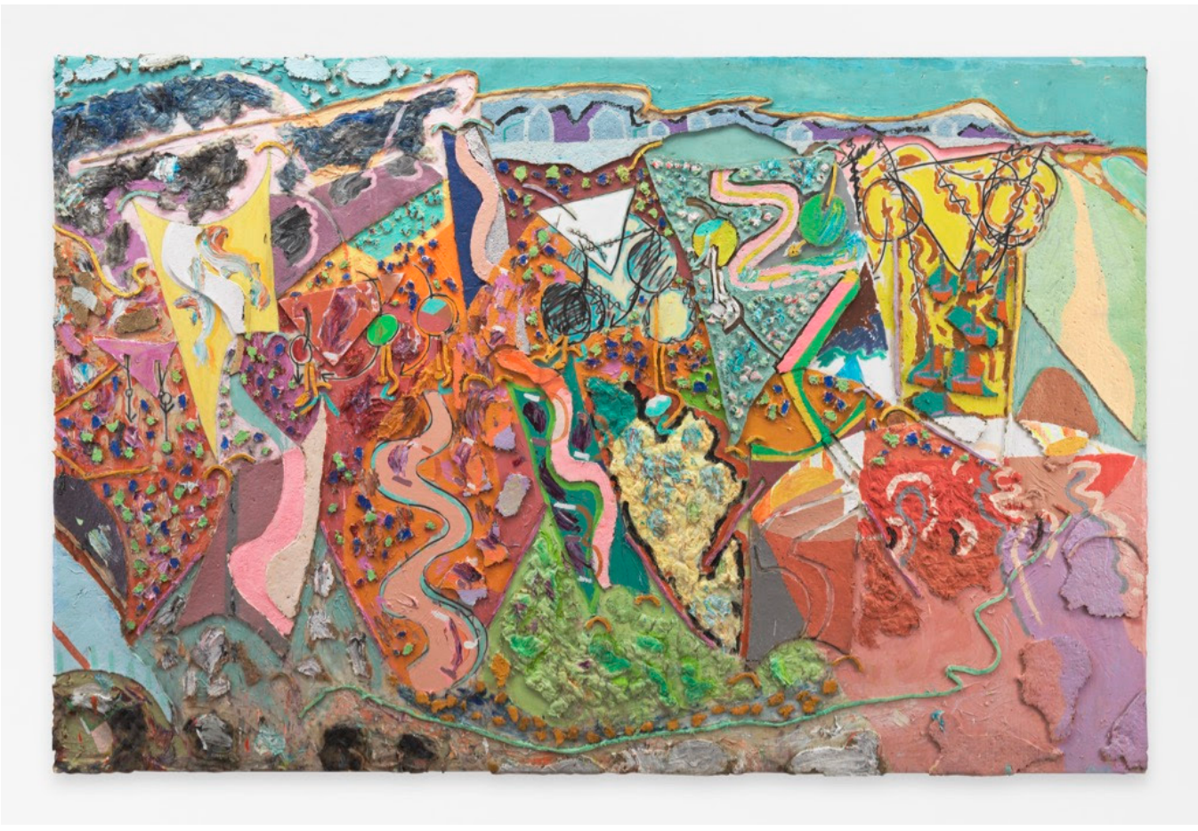
Larry Poons, The Compression Sisters, 1997, Painting After Postmodernism