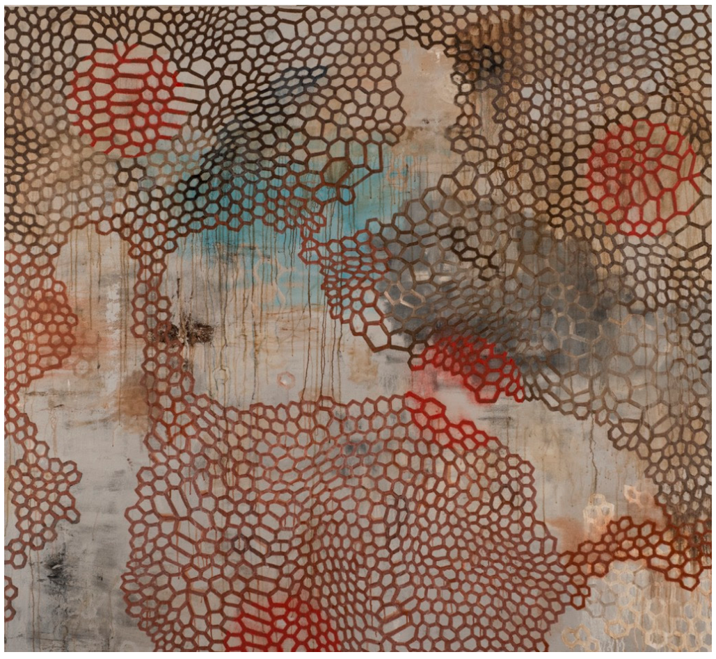
Paul Manes, Great Divide, 2016, Painting After Postmodernism

Painting After Postmodernism Vanderborght 50 rue de l'Ecuyer 1000 Brussels <u>www.pap.brussels</u>