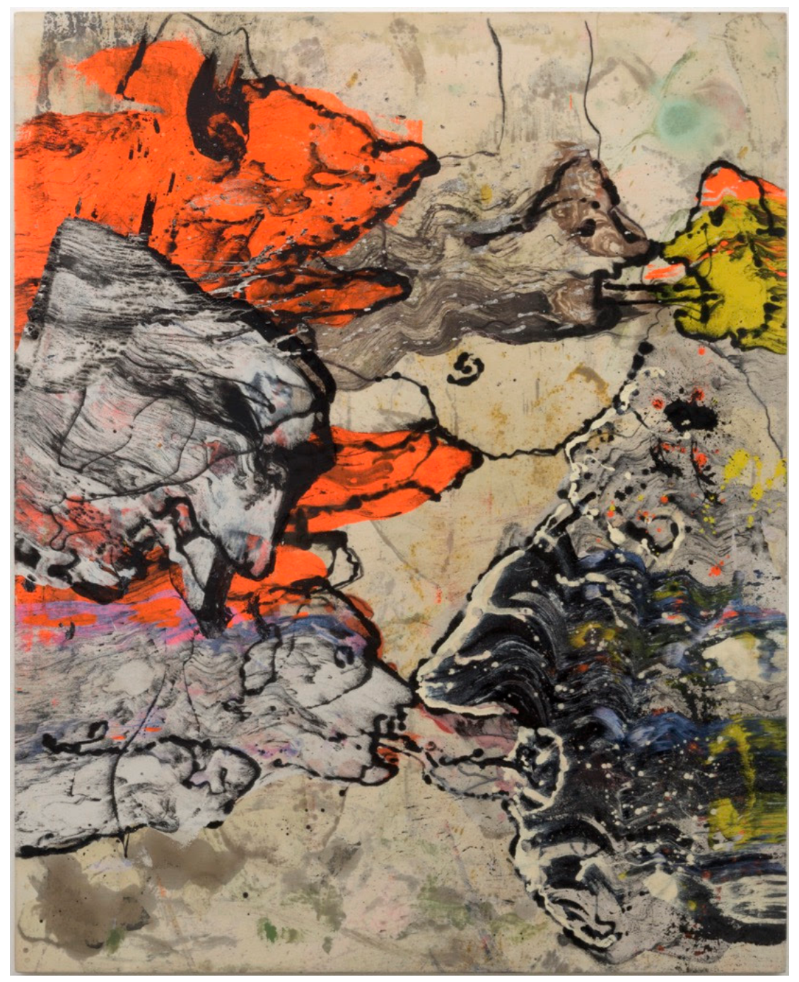
Ed Moses, Ranken 1, 1992, Painting After Postmodernism