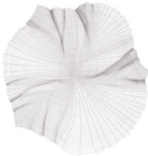
Robert Lansden. The Shape of Time (Time Means Nothing) . 2015, ink on paper. 32 x 24 inches

Landsen's titles are telling; The Sound of Rain , Light Through the Leaves , The Shape of Time . The surprisingly active drawings conjure associations both with the biological/anthropomorphic aspects of the natural world as well as the scientific complexity of the space/time continuum (the scientifically-minded use of his drawing algorithms is another tell). Landsen's skilled melding of complexity and fragility provide the perfect blend of timelessness and beauty that is space and nature at once.